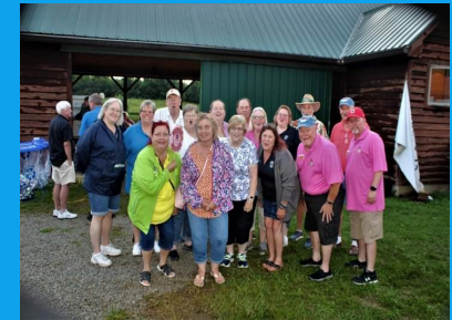
KY Bourbon Bash