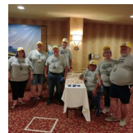
Region V Booth "Bad News Bears" Region Party