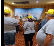
Region V Booth